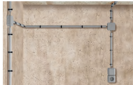
Flexible and rigid plastic pipes